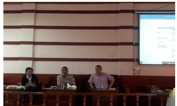
Meeting of Ad hoc Committee for revival of SSCSOA and to conduct elections to the Executive Committee