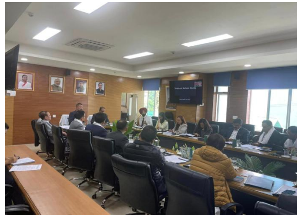
Scenes of Regional Conference of The All India Federation of North East State Civil / Administration Service Association held on 29 th October, 2022 at Tashiling Secretariat, Gangtok