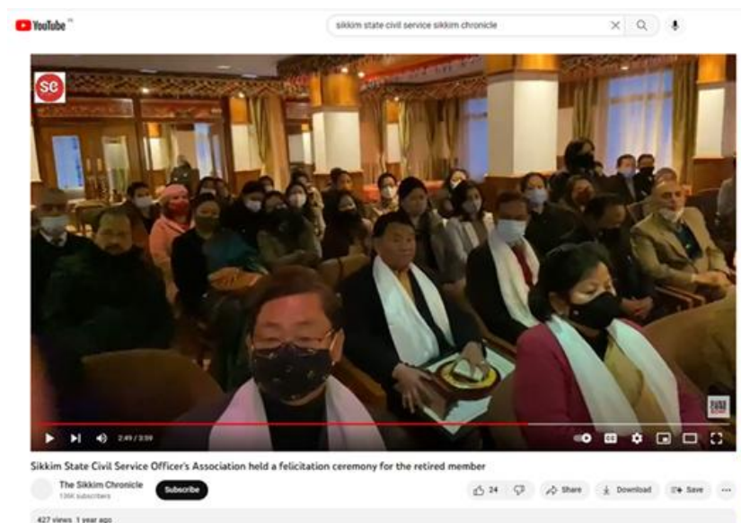
Felicitation of retirees, promotes and IAS inductees by SSCSOA at Tashi Delek Hotel on 26.02.2021