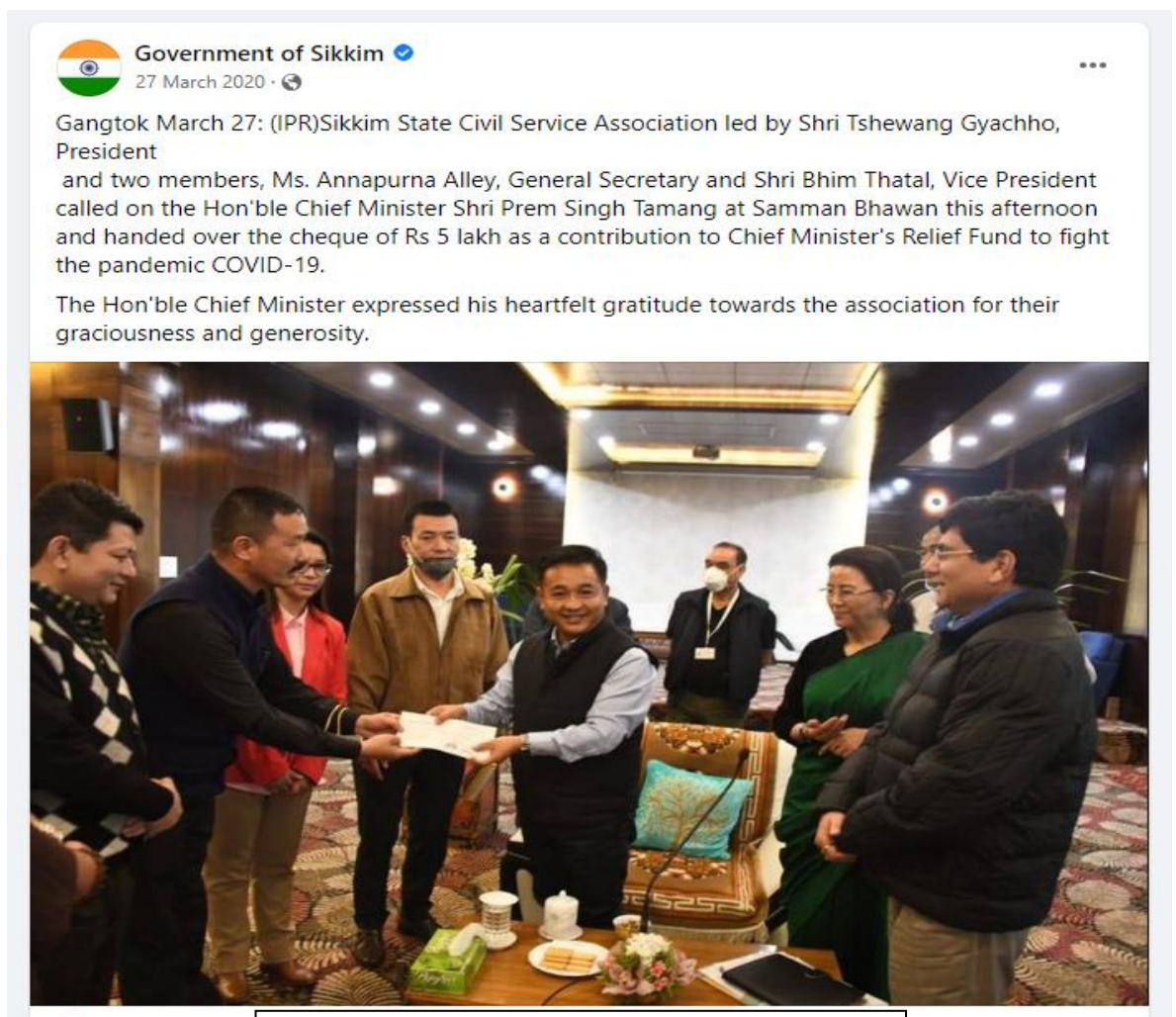
Executive Members -SSCSOA with the Hon'ble Chief Minister of Sikkim (Handing over contribution amount of Rs.500,000 of State Civil Services members towards CMRF during COVID-19)