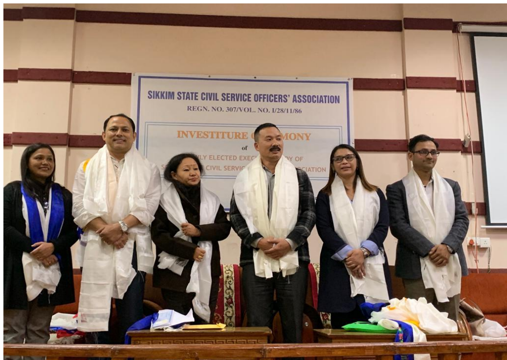
Elected Executive Members -SSCSOA 2019-2020 to 2022-2023